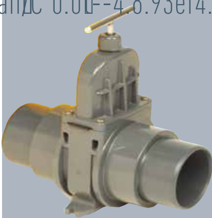
PVC inlet sluice valve DN 100 or DN 150, with pipe sockets bonded in, for the time-saving and space-saving direct connection to the inlet clamping flange.